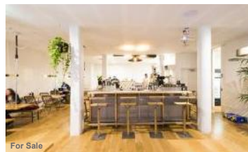
Shop 2 and Shop 3, 377 Lonsdale S... Retail 268m 2

Aurizon currently leases 10,700 square metres in Charter Hall's 175 Eagle Street and another 10,500 square metres in Japanese group Daisho's Mincom building on Ann Street.