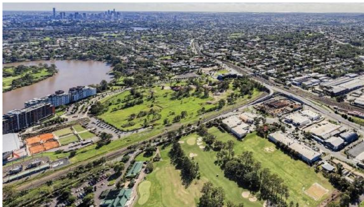
Consolidated properties Yeerongpilly Green site in Brisbane's south has been shortlisted for Catholic Education's next head office.