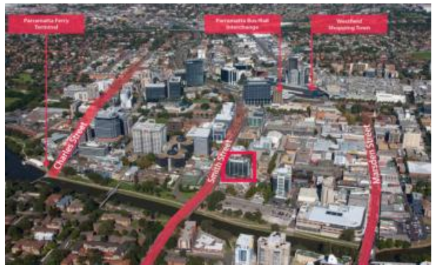
Fortius Sells Parramatta Site For $30m