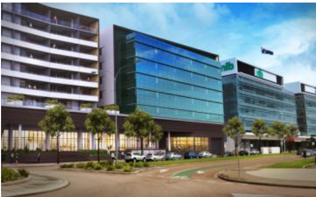
$38m Development Approved For Newcastle