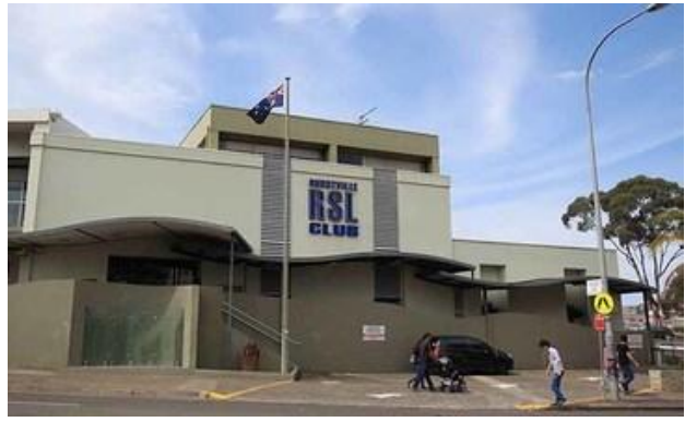
Pro-development Group Challenges RSL Hurstville Amalgamation