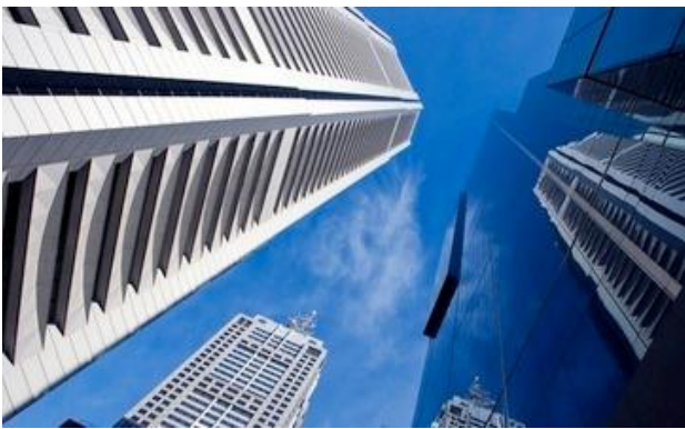
GDI Property In Final Stages Of $40m Acquisition