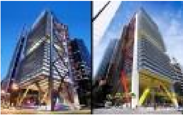
Sought-After Sydney CBD Commercial Office Space Now 100% Leased