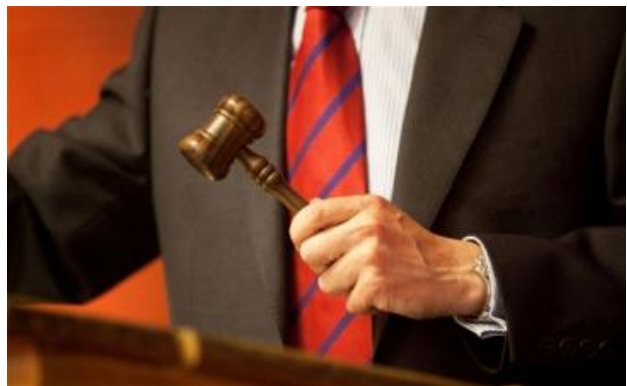
NSW Government Sydney Asset Sell Off